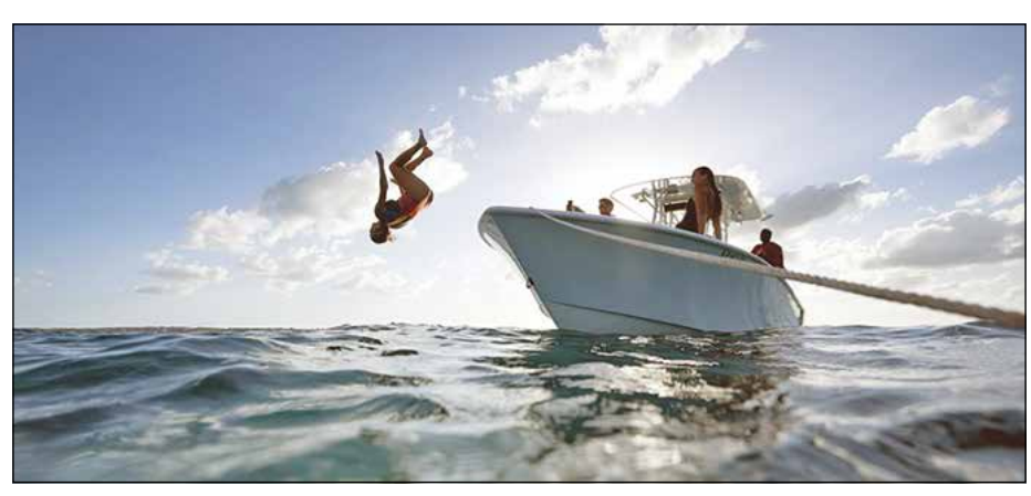
Swimming on local lakes is a great way to cool off on a hot summer's day. STOCK PHOTO Spring Outdoors

Visit Discover Boating's Go Boating Today tool to find out how you can secure your boating vacation on-demand this summer. Use the social media hashtag #SeeYouOutHere to share your boating.