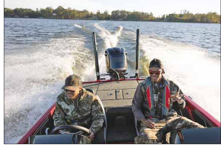
top: Water sports are a big draw to local lakes, from JetSkiing to water skiing to wake boarding to boating, the lakes are buzzing with activity in the summer. above: Boating in Wisconsin starts in spring and doesn't wrap up until fall.

Discover Boating, the leading resource for all things boating, helps people find easy ways to get on the water and provides tools and articles to get started. Check out these tips to start planning your next onwater adventure and make the memories of