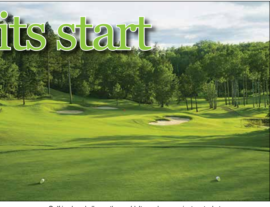
Golf is played all over the world. It may have ancient roots, but golf remains popular among people of all ages.