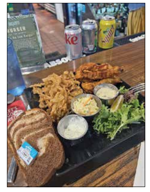
Archives Bar and Grill boasts homemade items such as tartar sauce, coleslaw, to go along with a menu option of a customer's choice.