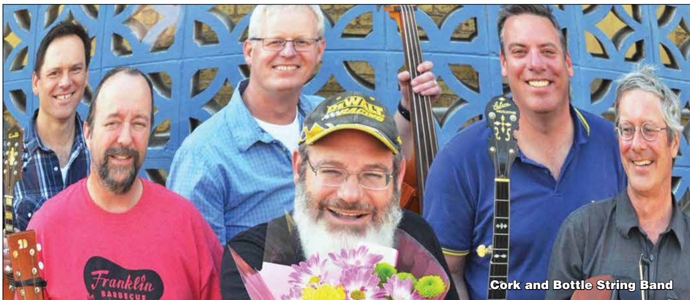
Cork and Bottle String Band