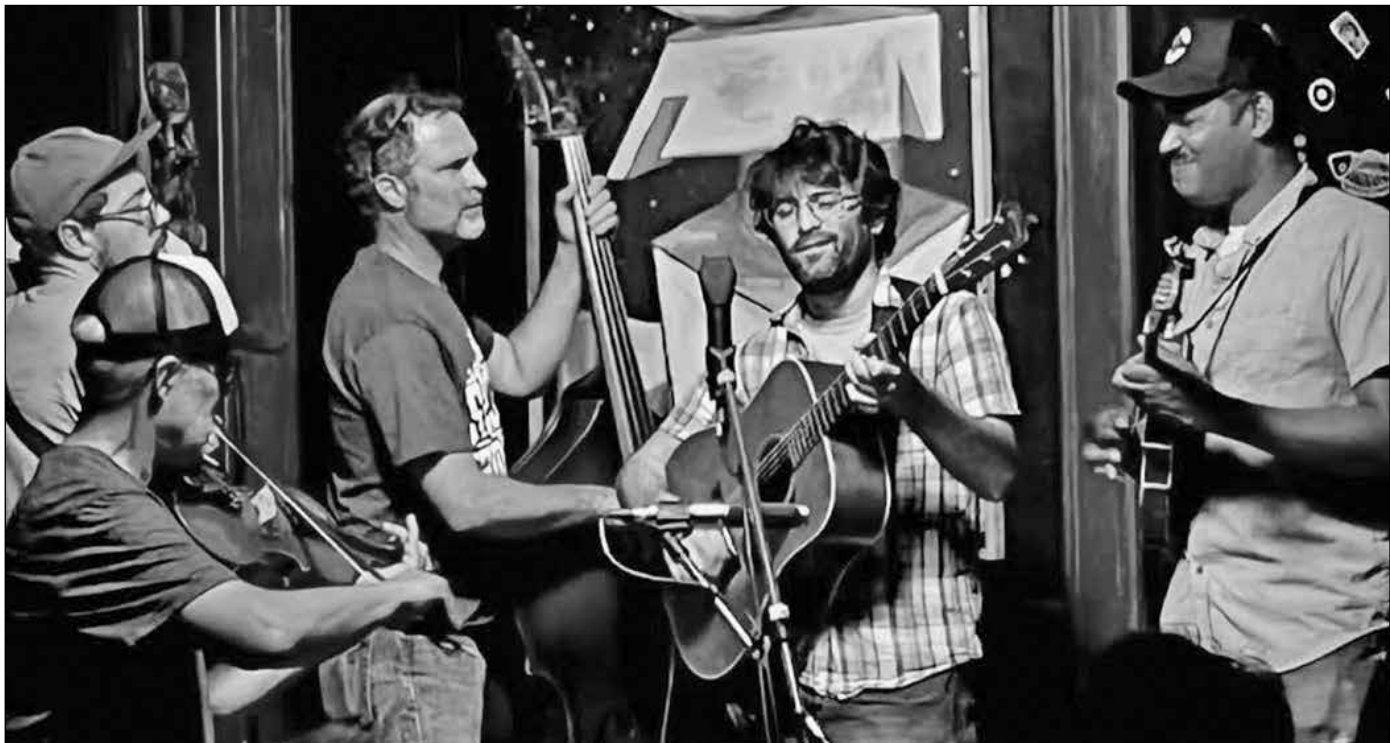
Dance Around Molly