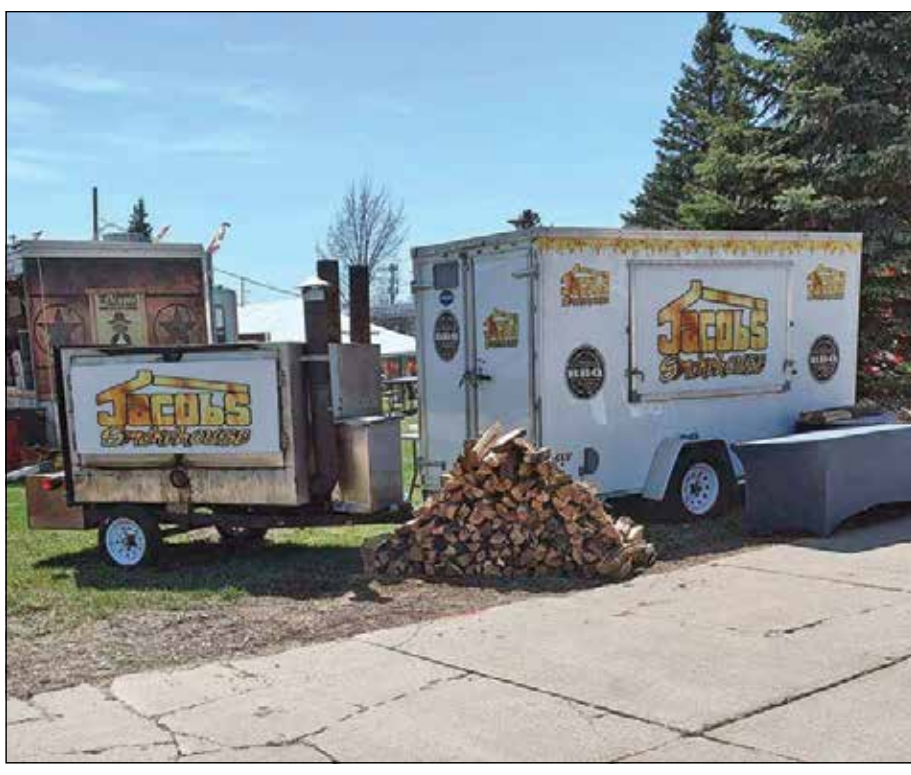
above: Jacobs Smokehouse, which has a brick and mortar store in downtown Burlington, also has a mobile trailer to take products directly to customers for private parties and community events. left: The restaurant features St. Louis-style barbecue ribs.

homemade barbecue sauces and a handful of dry rubs.