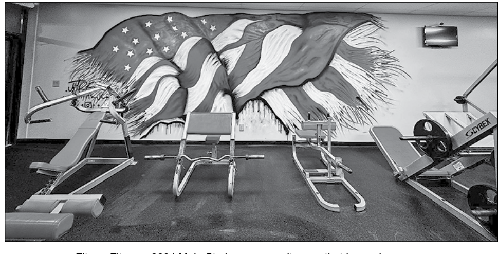
Fitway Fitness, 3224 Main St., is a community gym that hones in on your health and personal fitness needs in a welcoming space. PHOTO SUBMITTED Good Neighbors

The gym offers 24-hour access to an array of cardio and weight machines, as well as a substantial variety of free weights through an affordable membership. For details, visit easttroyfitway.com.