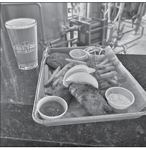
East Troy Brewery Fish Fry

Call (262) 642-5264 to place your order or reservation today. For more information, visit lulabellsdockside.com.