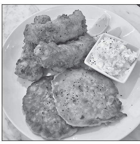
Alpine Valley Resort Fish Fry