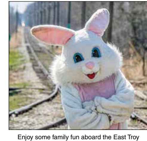
Electric Railroad's Bunny Train. Get tickets at easttroyrr.org.

Tickets are $20 for adults, $16 for children ages 3-14 and $11 for children ages 0-2. For more information, visit easttroyrr.org.