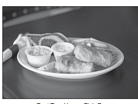
East Troy House Fish Fry