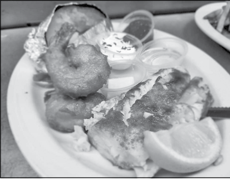
Lulabell's Dockside Fish Fry