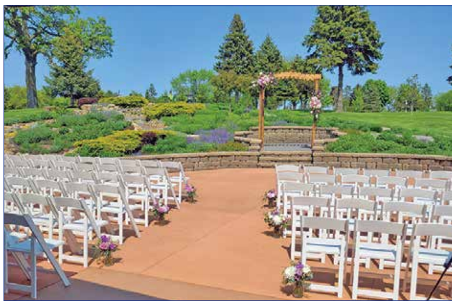
above: The outdoor site for a wedding ceremony at Evergreen features a hill and waterfall, providing an eye-catching background. top: This couple enjoys a stroll through the grounds at Evergreen, one of several areas where wedding photographs can be taken for the collection. opposite bottom: Tables decorated with napkins that compliment wedding colors, along with gold flatware and chairs provide an elegant look. opposite top: A couple kisses with the beauty of the room at Evergreen serving as a backdrop.

Spring Bridal