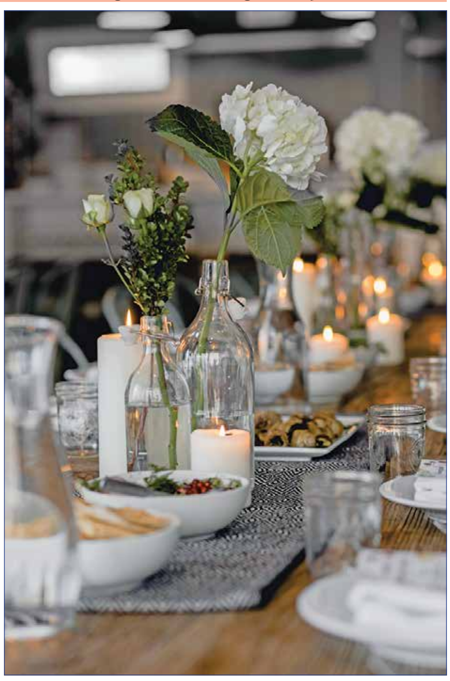
There are several factors couples might want to consider as they aim to provide a tasty meal for their wedding guests. One suggestion is to align the food choices with the degree of formality the wedding will present.