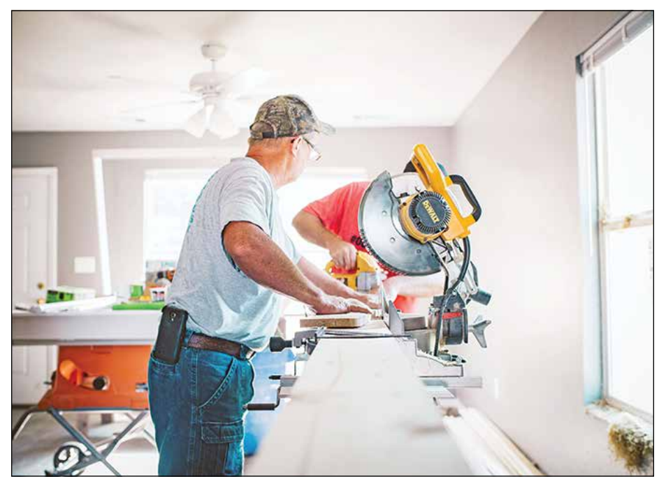
Homeowners should avoid contractors practicing aggressive tactics or insisting on receiving full payment before beginning the project. According to the Better Business Bureau, most deposits for such projects should range between 10-30% of the total cost.

Receiving multiple quotes gives homeowners a solid understanding of pricing and services. It contributes to their ability to converse with their chosen contractor about the project's price. Homeowners who take the time to interview multiple companies before deciding who to contract can be confident