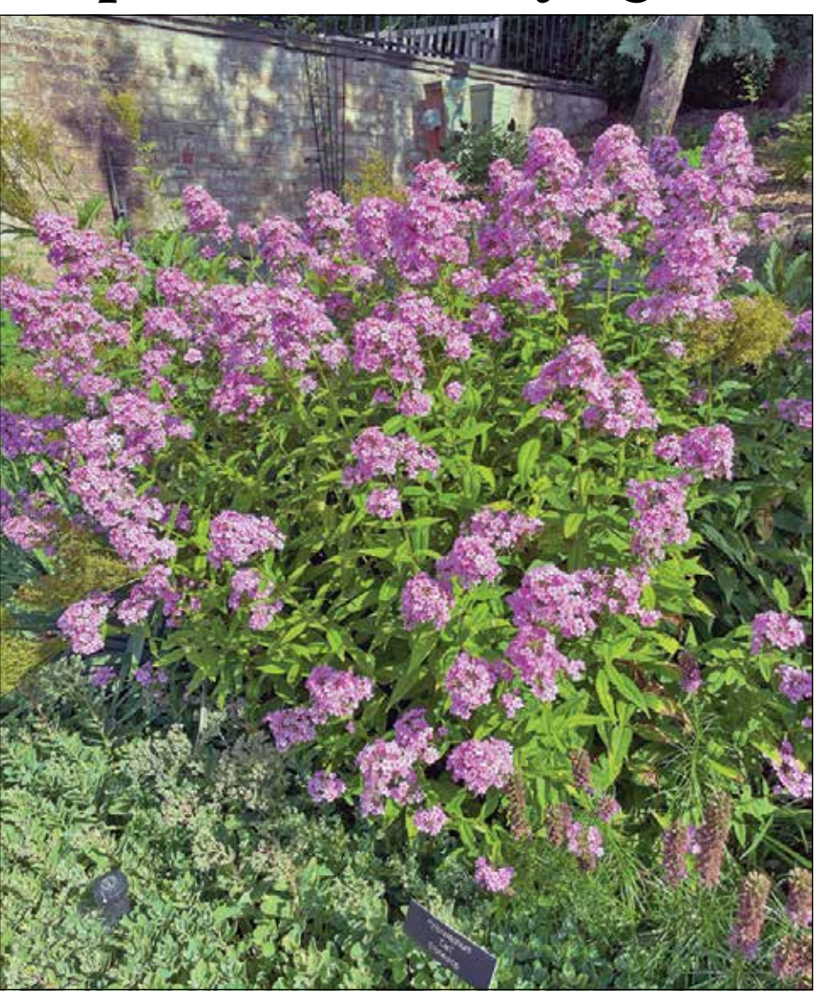
Jeana garden phlox (Phlox paniculata 'Jeana') is the 2024 Perennial Plant of the Year. It will grow in full sun with a bit of afternoon shade in hotter climates and was selected for its height and fragrant flower heads.

Enjoy the lavender-pink flowers with wine-colored eyes that cover the plant from mid-summer to fall. Although each flower is smaller than other garden phlox, the dense cone-shaped flower head is made up of hundreds of individual petals, providing