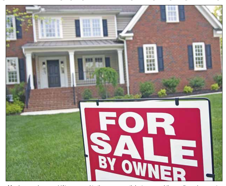
May home sales rose 11% compared to the same month last year, and the median price rose to $315,500, which is a 6.9% increase over the past 12 months. Despite the increase in sales, the numbers reveal the average 30-year fixed-rate mortgage rose 63 basis points over the past 12 months, hitting 7.06% in May and causing affordability to drop to an all-time low.

"The Fed focuses on core inflation when deciding whether to cut shortterm rates to stimulate the economy. Core inflation omits the food and energy sectors since they are somewhat volatile and less reflective of long-term inflation