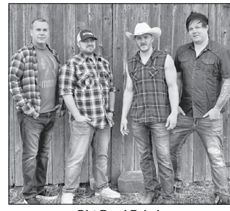
Dirt Road Rebelz