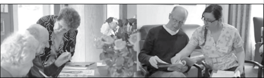
"To All of the Wonderful People at Azura Memory Care,

We would like to thank each and every one of you for taking care of our Mom with such loving kindness and compassion. We were so blessed to have her live in such an amazing home!! We appreciate everything you all do!"