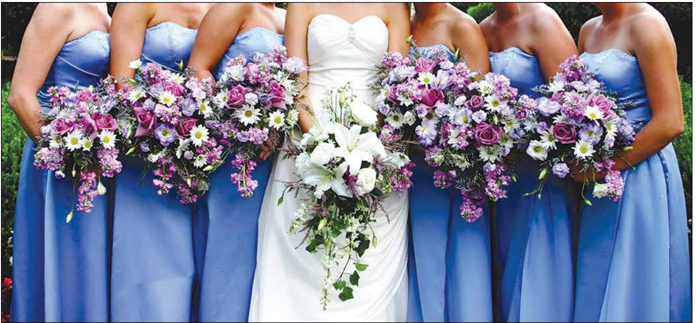
During a wedding, the couple tying the knot certainly gets to shine, but so, too, do other ceremony participants. Bridesmaids lend support and provide help as needed, and the maid of honor serves as the right-hand woman to the bride.