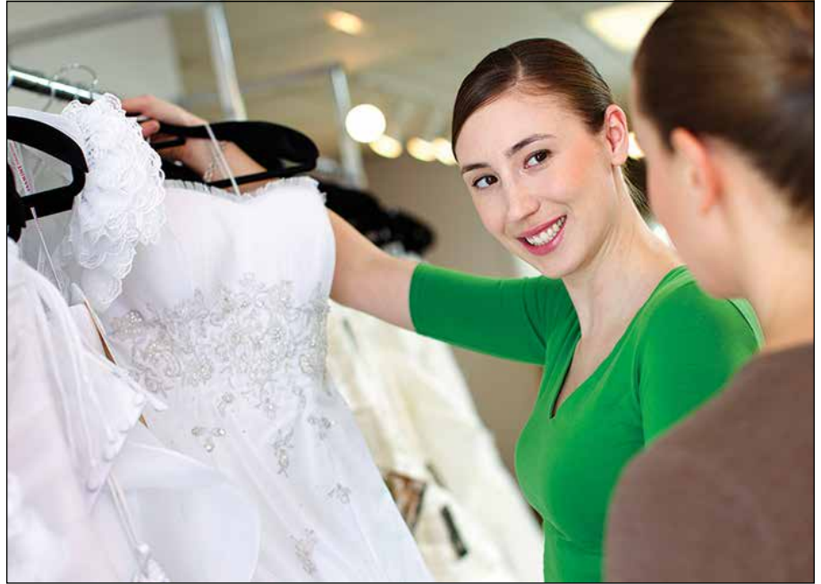
In western cultures, white wedding gowns have been the standard since the nineteenth century and are believed to symbolize purity and grace. In eastern cultures, wedding gowns often have been elaborate, colorful creations that have their own symbolic meanings unique to various areas of the world.

Try on a few different styles even if you