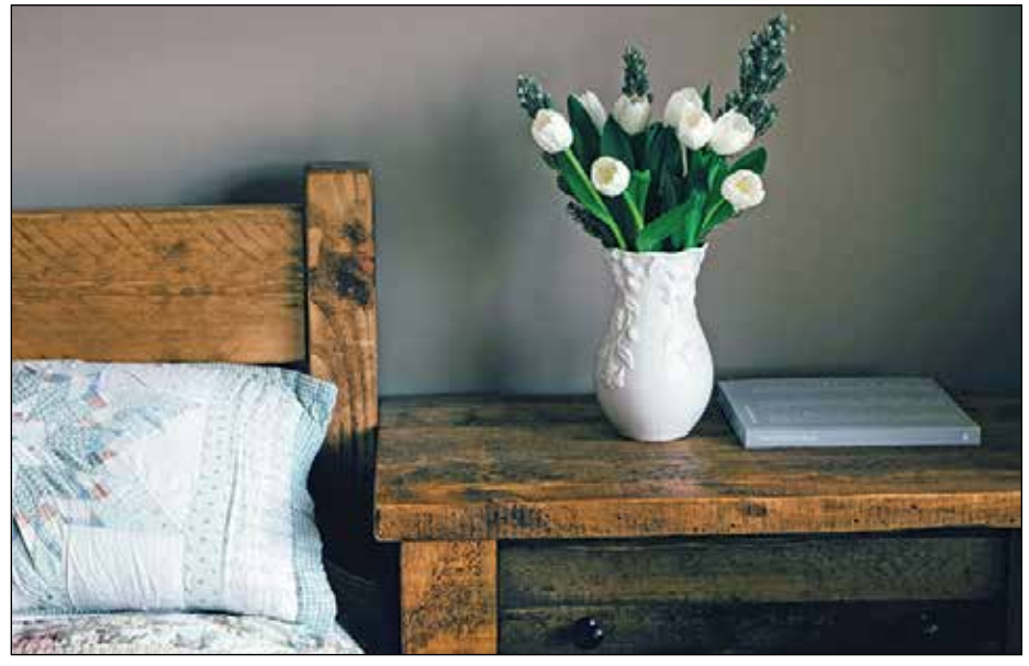
Whether hosting guests during the holiday season or any other time, suggestions to make the space more welcoming and comfortable include having a chair - if space allows - and putting a nightstand or small table next to the bed.

Hotels ensure guests have ample creature