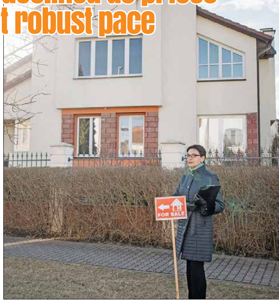
The existing home market saw fewer sales in September 2024 relative to that same month last year, with 8.7% fewer sales over the most recent 12-month period. Thanks to a strong start to the year however, year-to-date home sales are up 3.8% compared to the first nine months of 2023. STOCK PHOTO Homes & Design

Published by Southern Lakes Newspapers LLC 1102 Ann St., Delavan, WI 53115 (262) 728-3411