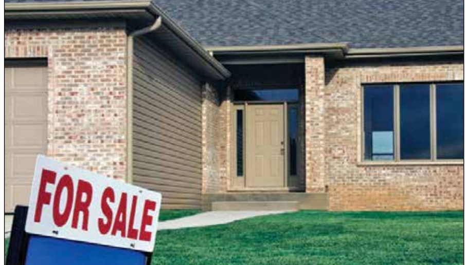
Home title theft is not common but can be devastating. Home title thieves create fake IDs, Social Security cards, and other documents to impersonate you. Then they try to sell your property, transfer the deed to themselves, or withdraw equity by refinancing your mortgage or opening a home equity line of credit in your name. Homes & Design

Your house may not be for sale – but that might not be enough to stop offers from coming in. A case of home title theft, also known as title fraud, deed fraud, or "house stealing," was recently reported to DATCP.