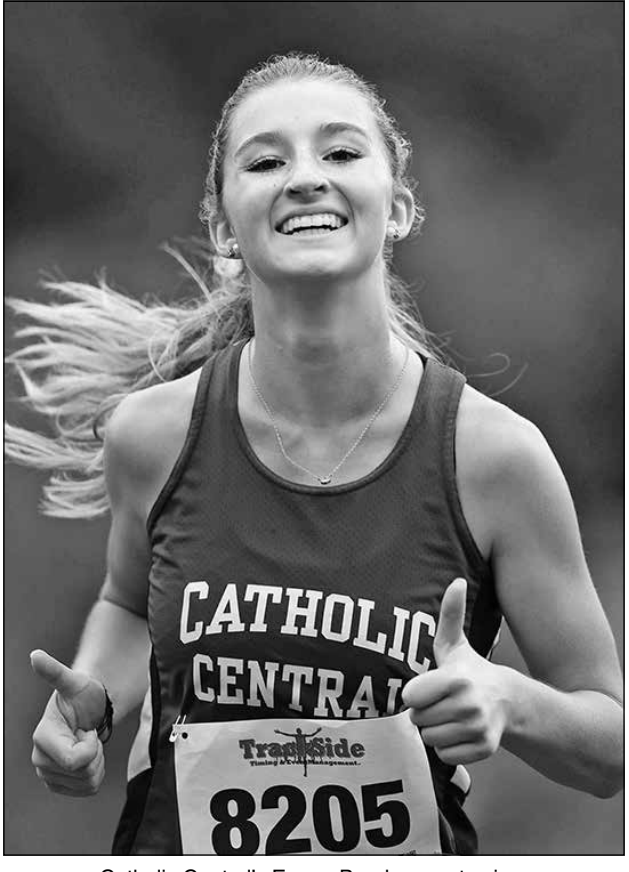
cross country meet as a junior last year.

Grove High School last year. Wonders of Bacine County