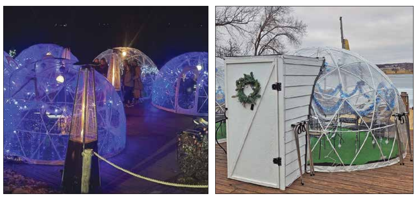
above right: Enter the igloos at Mars and order your favorite beverage and snacks from the special menu.

Pier 290 is at 5 Liechty Dr., Williams Bay. To reserve an igloo, visit pier290. com/lakeside-igloos.