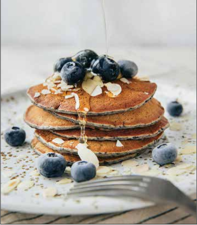
Individuals can consider several strategies in an effort to stay on track with healthy eating – beginning with setting goals and celebrating their successes. Recommended food choices include vegetables, fruits and whole grains such as low-fat dairy products, fish, poultry, beans and nuts.

said. "Be aware that sugary beverages such as fancy coffee drinks, smoothies, energy drinks, rehydration drinks and sodas may have a high concentration of sugars."