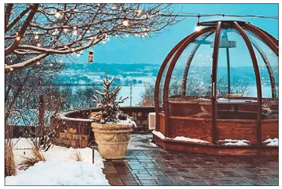
above: Enjoy the beauty of the outdoors from the inside of a glass and wooden globe at Geneva National. Take in a winter view of Lake Como while sharing snacks with friends. Dining Guide