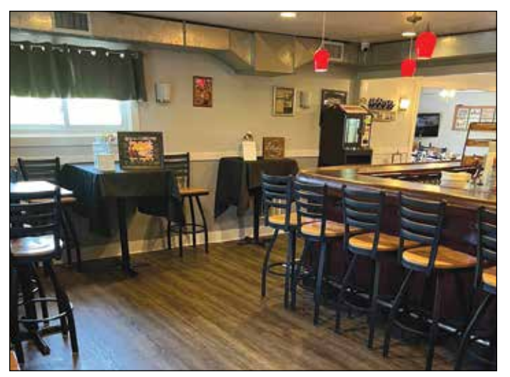
The interior of Luisa's has a good amount of space for those dining in, including room for large groups. Dining Guide