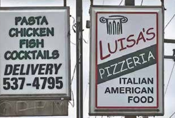
This building has been the home of Luisa's or over 25 years. The restaurant also offers several Italian entrees and many other food items. Raised high in the air, the sign for Luisa's Pizzeria, which is in Salem, can be seen from Highway 50.