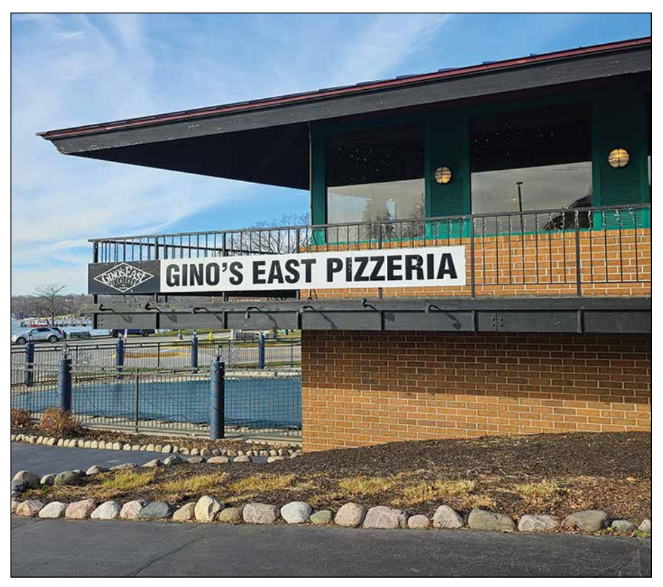
Gino's East, located at 300 Wrigley Drive is ready to provide the pizza you are craving.

"Built on the legacy of great family cooking by the likes of my great grandmother and father, Luisa's dedicated staff works with the best ingredients to serve phenomenal pizza, traditional Italian dinners, American dishes, and sandwiches every day," he said on the website.