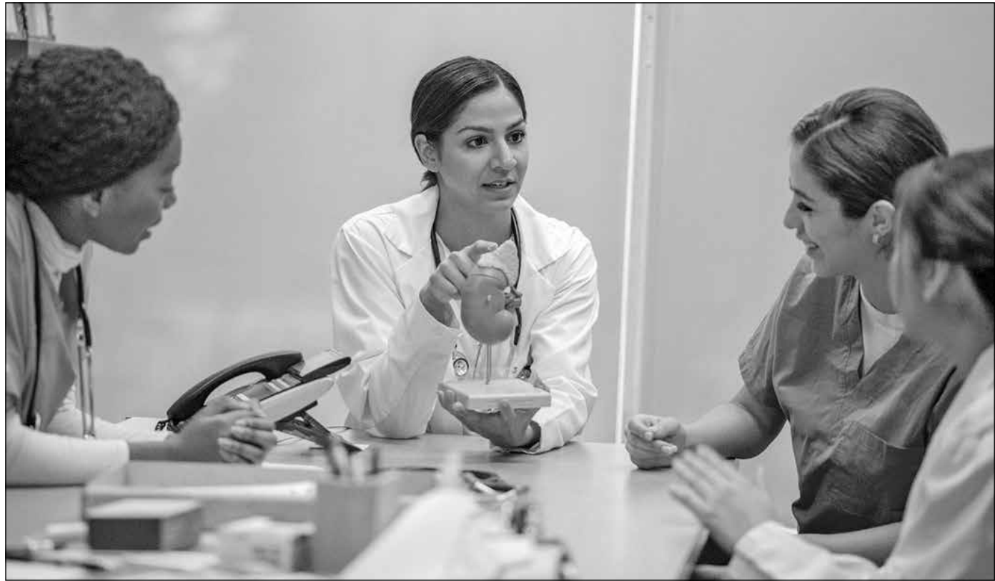
Experienced registered nurses capable of teaching others will always be needed. In addition to educating the next generation of nurses, instructors can also pursue careers in writing textbooks or educational materials, managing and creating curricula, and developing and teaching continuing education with major organizations.

Nurse instructors reported a median annual wage of $80,780, per the U.S. Bureau of Labor Statistics. Median refers to the