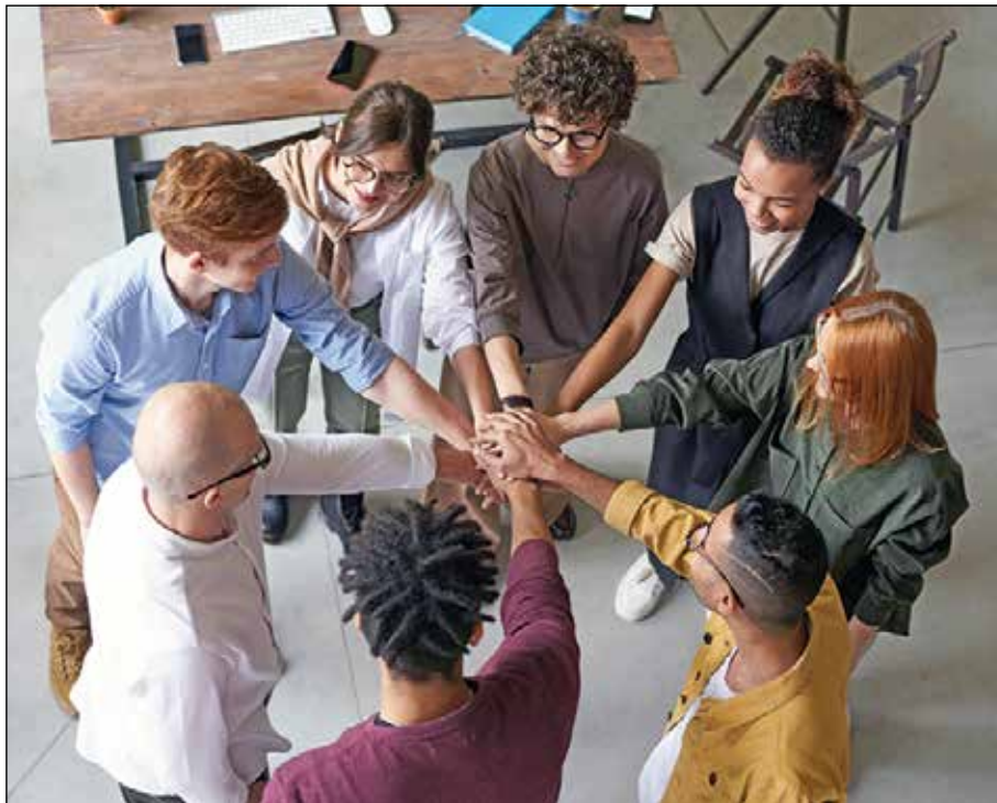
From bringing your nurses a treat or hosting a fun game to organizing a volunteer outing in the community (such as an animal shelter) you'll be recognizing them and strengthening the team.

• Say thank you with meaningful notes and gifts – Arrange for the staff, patients, and nurses' families to provide a personalized notes and add a gift to give