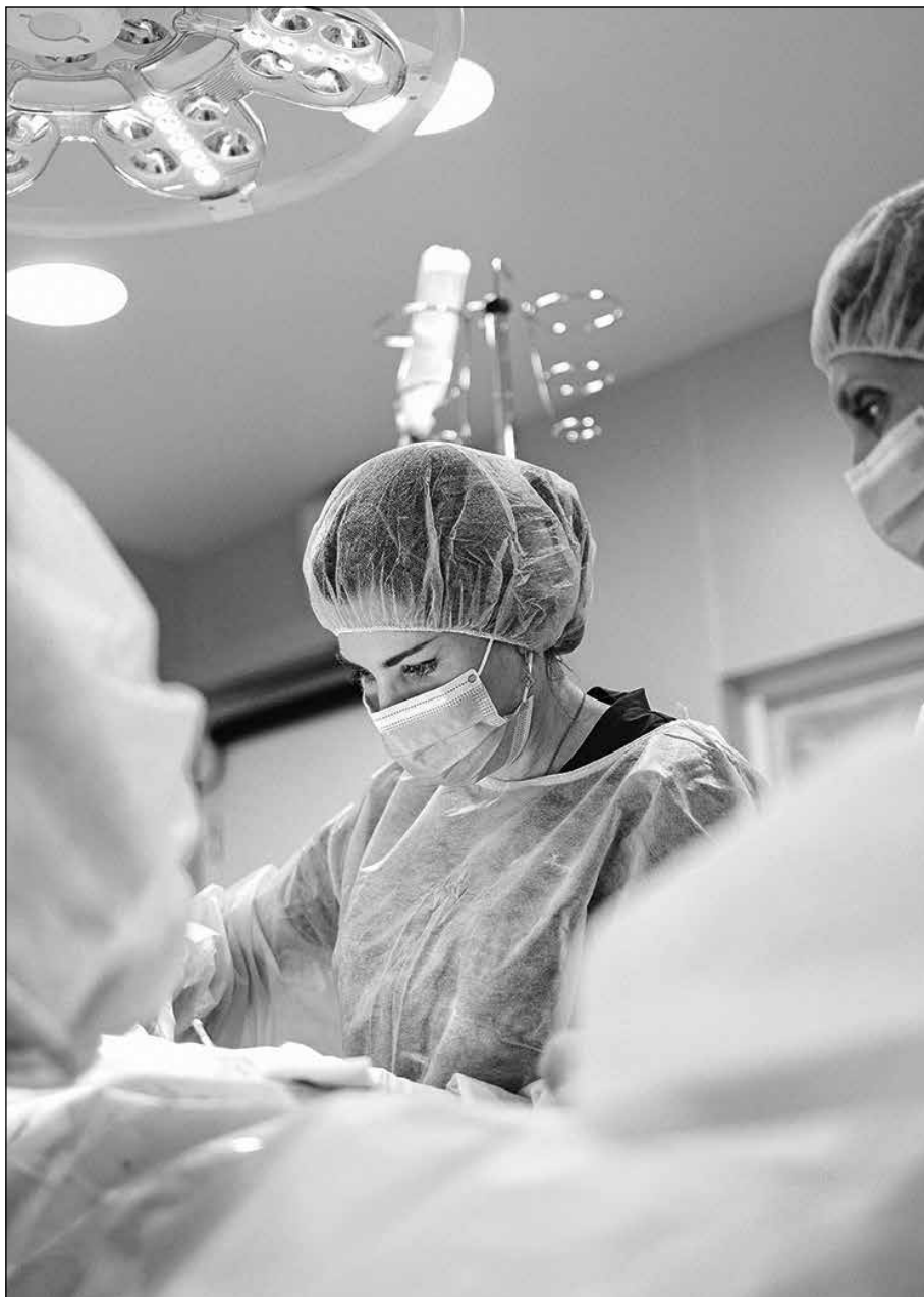
To become a surgical nurse, also known as an operating room nurse, you will need to follow specific educational, certification, and practical training steps. As you work toward becoming a surgical nurse, you will have a lot of responsibilities that cover everything related to surgery.

Cardiac surgical nurses work with patients who are undergoing heart-related surgeries, such as bypass surgeries, angioplasties, or heart transplants. Your duties would be similar to those of an orthopedic surgical nurse but with a focus on the cardiovascular system. It requires a strong knowledge of the human cardiovascular system and related diseases.