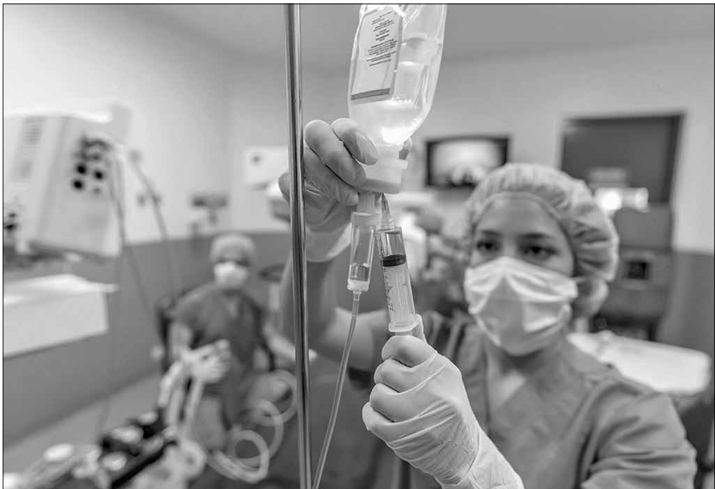
Nursing is a challenging and rewarding profession that features people performing a range of services. Anyone who has been in an intensive care unit (ICU) or visited a loved one in an ICU may understand the stress that nurses working in such wards are under.

Individuals who want to express their appreciation for ICU nurses can support efforts to ensure the ratio of 1:1 is reestablished at their local health care