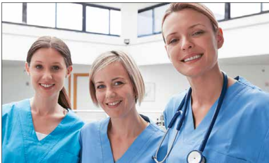
National Nurses Week, May 6-12, is recognized by many organizations. National Nurses Day, which is May 6, was declared in 1982 and 12 years later, the celebration to Nurses Week became permanent.

"Nurses Week is our time to shine. Let's lift each other up and recognize the good in what we do every day. It's easy to dwell on everything that needs to be changed, but for one week, I challenge you to look for the good. Recognize your nurse besties, mentors, and the nurses who make a difference in your day," an article on nurse.org says.