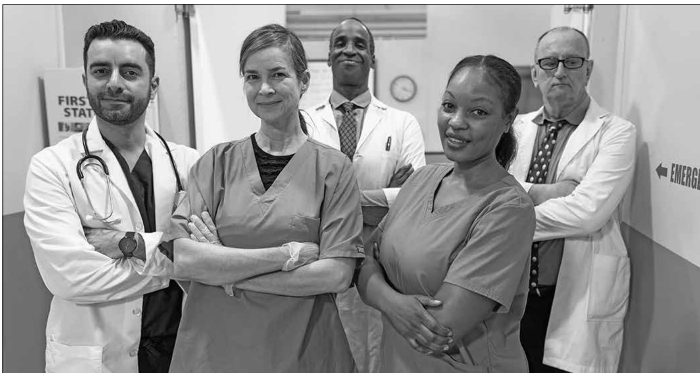
Though nurses deserve to be celebrated throughout the year, National Nurses Week is an ideal time to do something extra for the nurse in your life. There are a variety of ideas for family, friends, patients and even fellow nurses.

Bring in a sweet treat – Pick up goodies from a bakery or coffee from a favorite local shop.