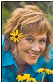
By MELINDA MYERS Contributor

Growing cilantro is easy, but this cool-weather herb quickly flowers and goes to seed as temperatures rise. This can be frustrating as some vegetables typically combined with cilantro, like tomatoes and peppers, ripen during the warmer summer months. Try making multiple plantings, using all parts of the plant, or growing more heat-tolerant options to extend your enjoyment.